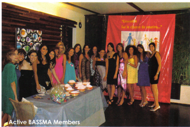
Active BASSMA Members