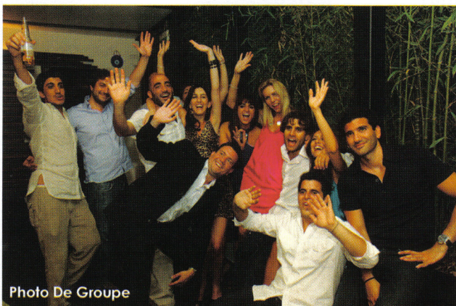
Photo De Groupe